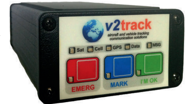
v2track hardware can be panel or remote mounted.

aviation, vehicle and marine assets in real-time across the globe for numerous international clients. The product has evolved to include a variety of advanced messaging options and other features thanks to close customer relationships and customised solutions which have later been adapted to become part of the generic product offering. Two such examples include helicopter specific telemetry and triggers, and Electronic Flight Bag data recording.