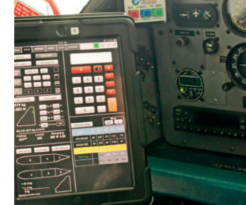
A customer's EFB app linked into v2track via the v2Connect API for data messaging back to base. can include details such as

Manifest or job and despatch data can also be captured and automatically transmitted. For aviation this